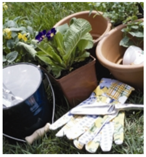
Gardening burns calories and improves diet.

And finally, gardening is a great way to manage stress. Spending time outside and tuning in to the rhythms of nature, we're reminded to be patient, slow down, and breathe the fresh air. Whether growing flowers, vegetables, or herbs, a garden reminds us of our connection to life and the abundance that nature so freely gives.